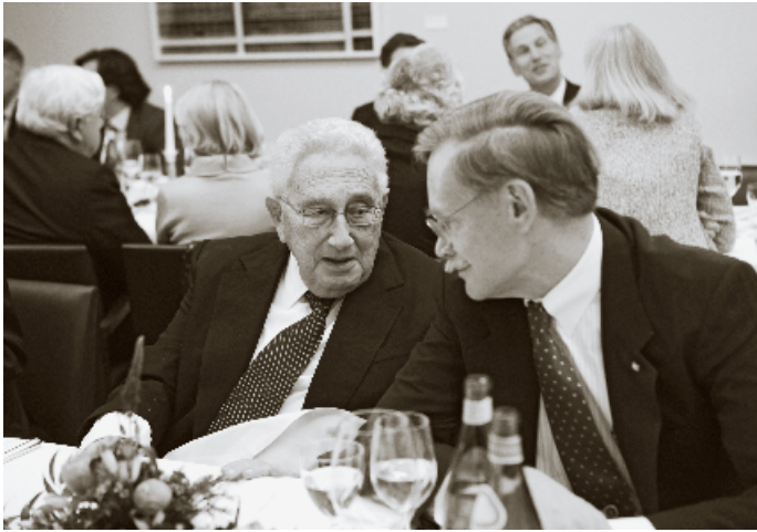
HENRY A. KISSINGER AND ROBERT B. ZOELICK